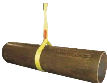
FLAT SLING USED IN CHOKER

Factor of safety for webbing 1:7 and for steel terminals 1:4