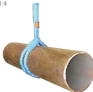
ROUND SLING USED IN CHOKER