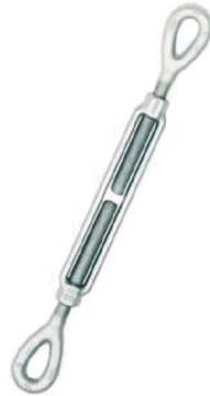
SL-226 EYE & EYE