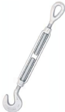
SL-225 HOOK & EYE