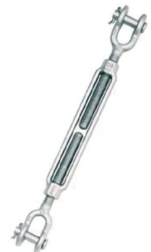
SL-228 JAW & JAW