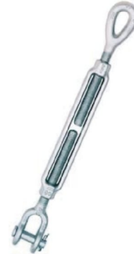
SL-227 JAW & EYE