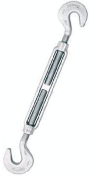
SL-223 HOOK & HOOK